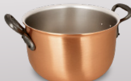
POT AU FEU