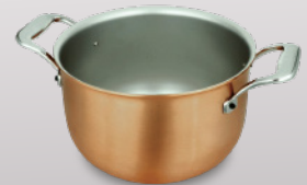
POT AU FEU