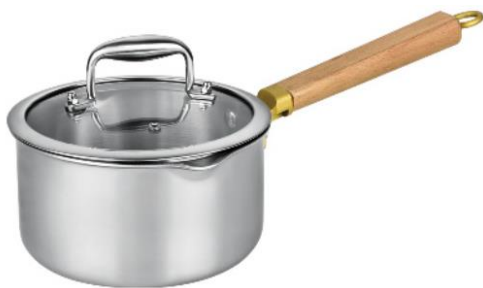
GD-7305 Sauce pan 16/18cm