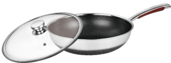
GD-7307 Wok pan 30cm