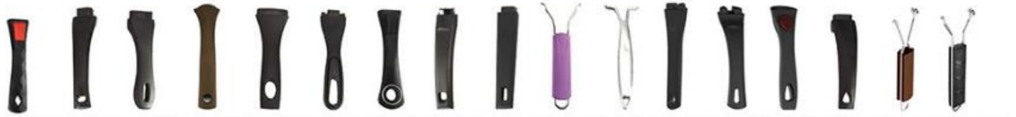
H35 H39 H40 H42 H43 H44 H45 H46 H48 H50 H51 H53 H54 H55 H56 H061 H066