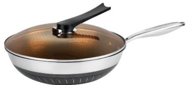
GD-7308 Wok pan 28/30/32cm