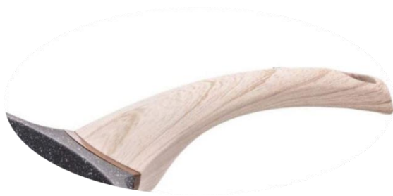
Optional labor-saving handle