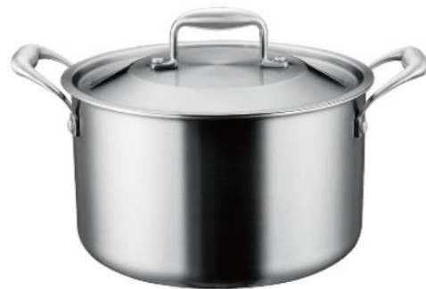
GD-7306 Casserole 20/24cm