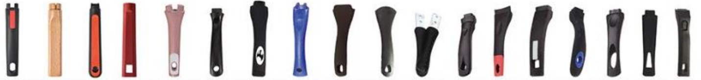
H111 H123 H133 H134 H05 H06 H07 H08 H09 H10 H14 H18 H19 H20 H22 H23 H25 H27