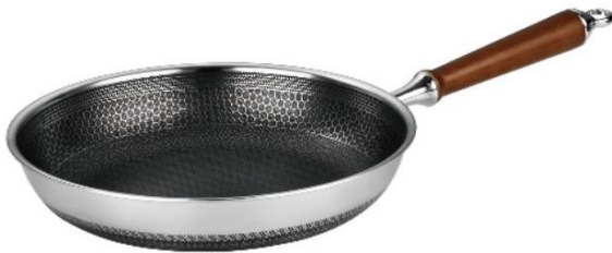
GD-7303 Frypan 24/26/28cm