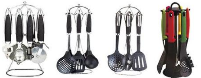
N01 N02 N03 N04