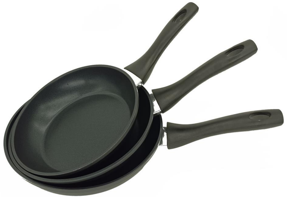
Normal full induction

Full induction, the safest, Most efficient way to cook. Save 20% energy!