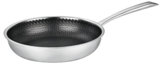
GD-7302 Frypan 24/26/28/30cm