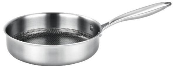
GD-7304 Saute pan 24/26cm