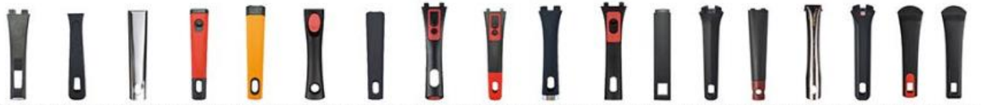
H065 H073 H078 H079 H080 H087 H088 H090 H091 H092 H104 H110 H114 H115 H118 H122 H142 H143