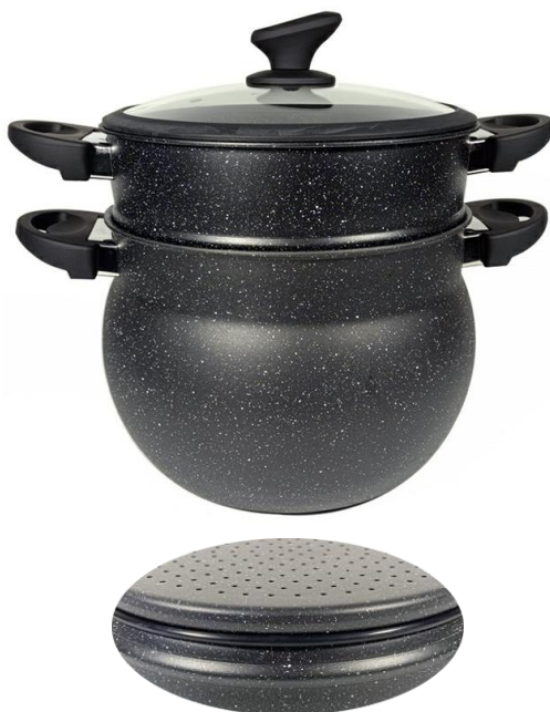
Insert silicone seal