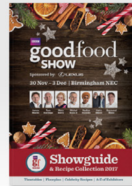
Birmingham NEC Winter November/December 2018