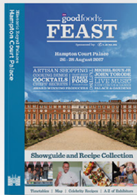
FEAST, Hampton Court Palace August 2018