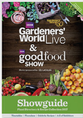
Birmingham NEC Summer 14 - 17 June 2018