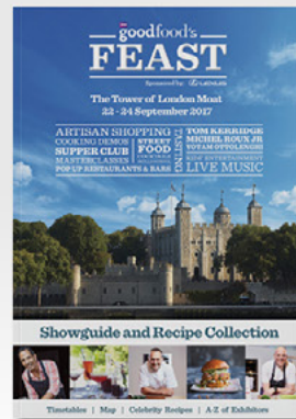
FEAST, Tower of London September 2018