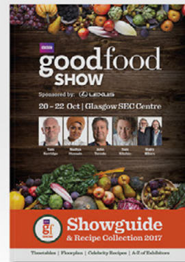
Glasgow SEC Centre October 2018