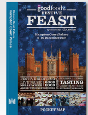
Festive FEAST, Hampton Court Palace December 2018