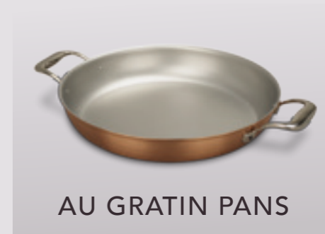
AU GRATIN PANS