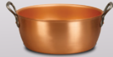
JAM & SUGAR PANS